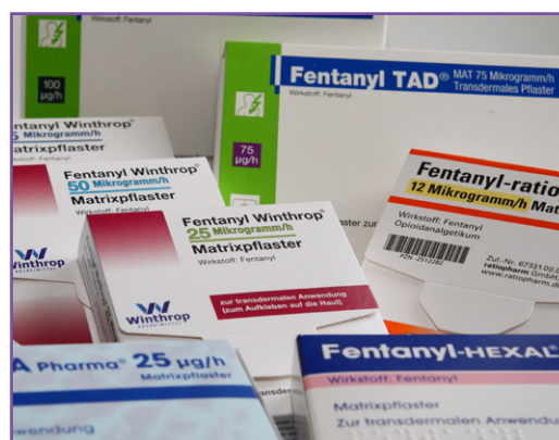
Fig. 1: Pharmaceutical fentanyl (patches)

While pharmaceutical fentanyl can be diverted for misuse, cases of fentanyl-related mortality in the US have been linked to illicitly manufactured fentanyl and a variety of fentanyl analogues. 4 These newly-synthesized fentanyl analogues are being sold as a standalone product, as a low-cost additive to increase the potency of heroin and even as counterfeit medicines. 5,6,7 The overdose death rate from synthetic opioids (excluding methadone but including fentanyl and tramadol) continues to increase in the US with a 72.2% increase from 2014 to 2015, with a total of 9,580 deaths in 2015. 8