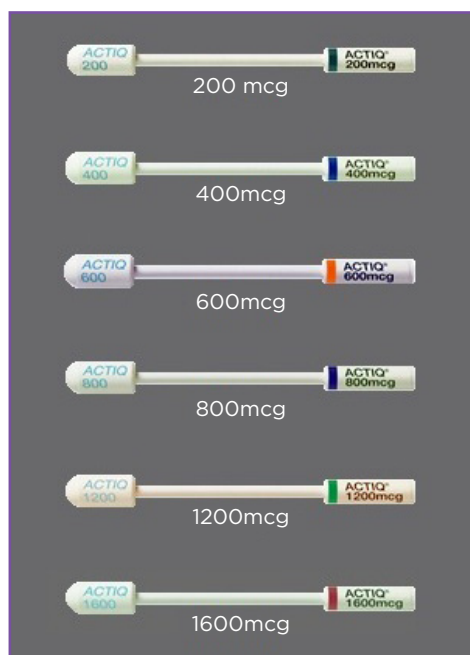
Fig. 5: Fentanyl 'lollipops'

Routes of administration: Pharmaceutical fentanyl products are currently available in the following forms: oral lozenges commonly referred to as fentanyl “lollipops”, effervescent buccal tablets (held in the cheek to dissolve in the tissues of the mouth), sublingual tablets, sublingual sprays, nasal sprays, transdermal patches, and injectable formulations.