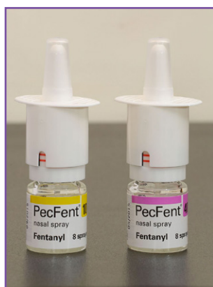
Fig. 7: Fentanyl nasal spray

Predicting duration of effect and half-life of fentanyl is a complex issue, affected by a number of factors. Its duration of action usually lasts 2 to 4 hours after intravenous or transmucosal delivery, but blood levels fall quite slowly after transdermal patch removal. The half-life of fentanyl varies significantly: ranging from 3-12 hours following injection (IV or IM) with fentanyl citrate, 42,43 which increases to approximately 17 hours when administered by transdermal system. This variation is due to continued absorption of fentanyl from the skin accounting for a slower disappearance of the drug from the blood. 2,43 It is of note that some fentanyl analogues such as alfentanil have a significantly shorter half-life. 44