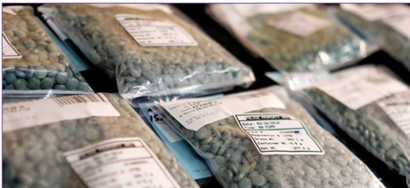
Fig. 8: Packaged fentanyl seized in Calgary, Alberta.

Analogues: In chemistry, an analogue is defined as a compound with a molecular structure closely similar to that of another . 52 Since the original synthesis of fentanyl, analogues with superior strength, onset time and other properties have been successfully produced. 47 Analogues of fentanyl can vary depending on the chemical structure, with some being less potent/toxic than fentanyl and some being significantly more. There has been documented military misuse of these analogues for their crowd controlling properties: in a particularly infamous case the presumed use of gaseous/aerosolized fentanyl derivatives by Russian security forces to incapacitate terrorists during a Moscow theatre hostage crisis in 2002 led to the death of over 100 people, including hostages, through a combination of the aerosol and inadequate medical care. 53