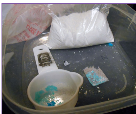
Fig. 2: Illicit fentanyl.

UK & Irish context: The UK National Crime Agency (NCA) found that since December 2016, post mortem toxicology results indicate that 60 drug related deaths in the UK were known to be linked to fentanyl or one of its analogues. 6,9