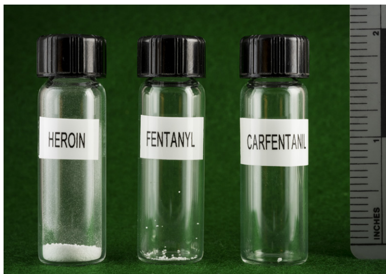
Fig. 3: Comparing the size of lethal doses of heroin, fentanyl, and carfentanil. The vials here contain an artificial sweetener for illustration.

Heroin-related deaths in the North East have also shown positive results for fentanyl, 16 and the Welsh Drug Identification Service WEDINOS have received 18 samples containing fentanyls since 2013. 18