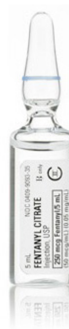
Fig. 6: Ampoule of pharmaceutical fentanyl citrate

Onset, duration of effects and half-life: Analgesia may occur as soon as 1 to 2 minutes after intravenous administration of fentanyl, whereas most buccal transmucosal delivery systems produce analgesia in 10 to 15 minutes. 39 In contrast, sublingual and intranasal sprays of fentanyl may produce analgesia in 5 to 10 minutes or sooner. 40 Fentanyl plasma concentrations do not peak or plateau until 8 to 16 hours after application of a transdermal patch. 41